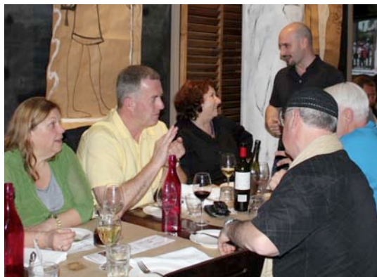
Some of our past participants at the dinner