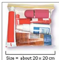
Size = about 20 x 20 cm

Please remember that there are limits regarding liquids, aerosols and gels (LAGs) that can be taken onto an international flight. For example see the webpage: http://www.qantas.com.au/travel/airlines/country-specific-carry-on-baggage/global/en If you do not have a plastic bag for your LAGs we recommend a 'Glad Snap Lock' brand sandwich bag (which fits within the limits of edges of 20cm). You can never have too many snap lock bags while in Egypt (for film/memory cards, paperwork etc) anyway! Please remember that if carrying on items like creams, lotions, hair gel, water, perfumes, lipstick, lip balm, lighters, toothpaste, sprays